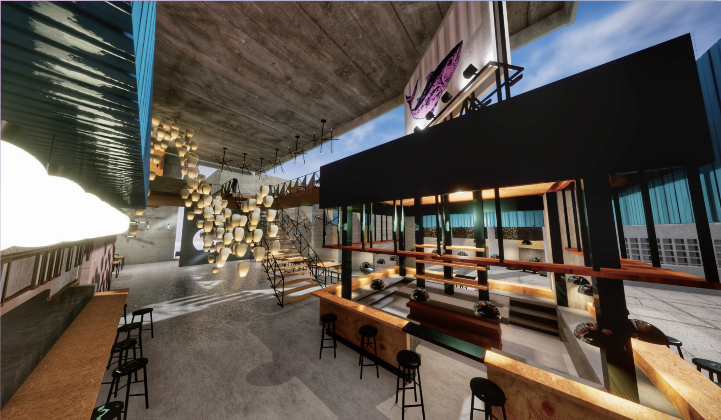
FIRST FLOOR DINNING SEATS