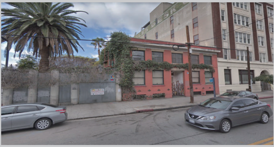
Kato CITY (Right) took place in the old commercial building in Art District DTLA