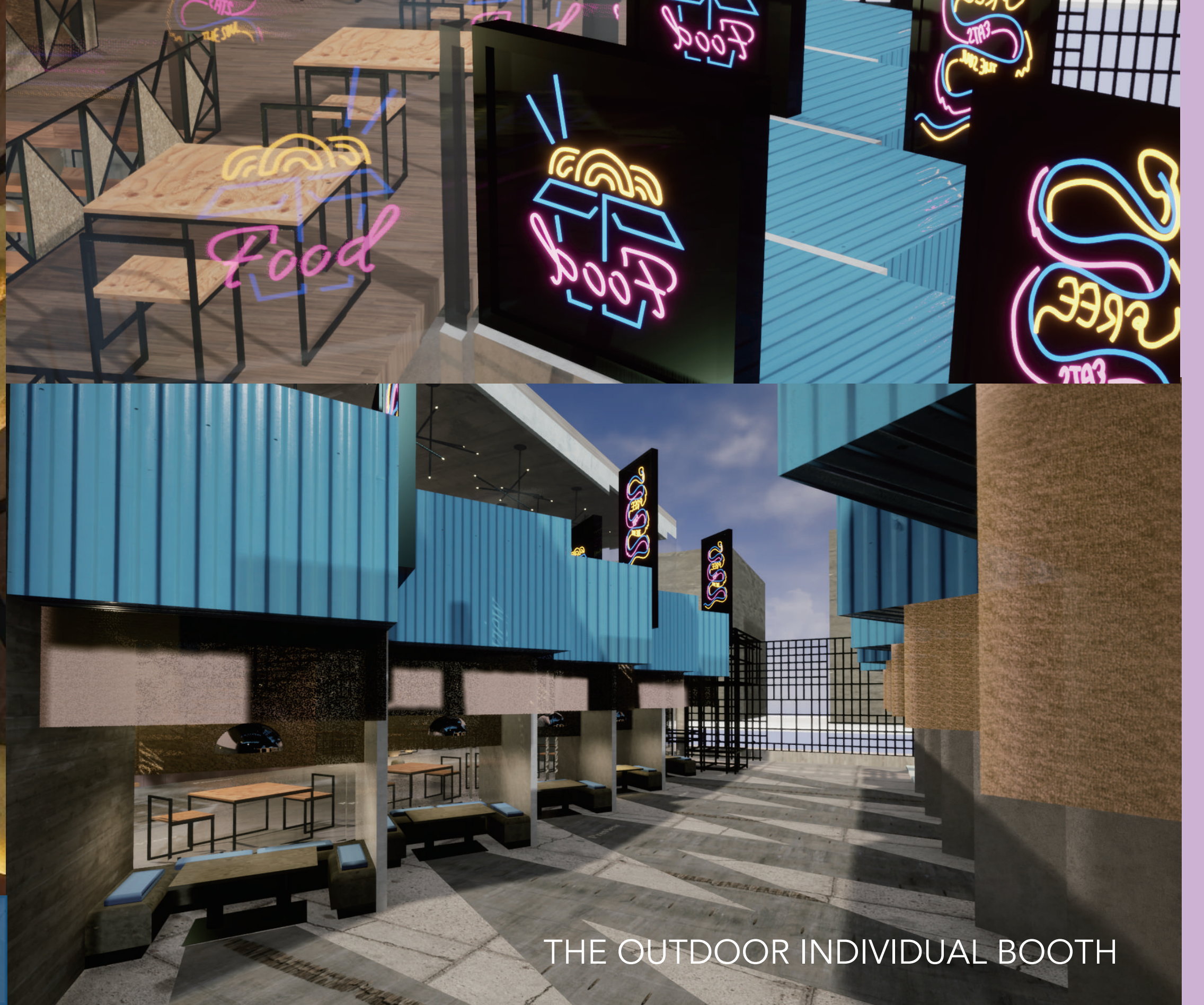
THE OUTDOOR INDIVIDUAL BOOTH