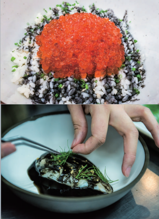
A TASTE OF CONTEMPORY TAIWAN AT KATO CITY